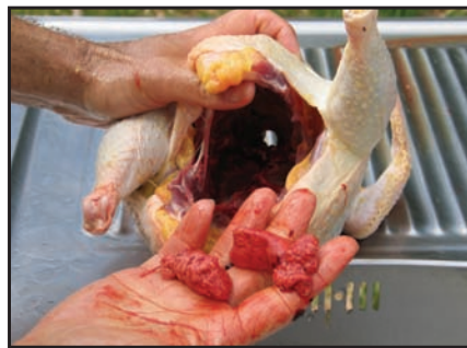
Popping out the lungs can be a bit tricky.

Reach into the cavity one final time and remove the lungs. Again, lead with the fingernails as you follow the curve of the rib cage, finding the seam between rib and lung, and lift the spongy lung tissue free. This step takes some