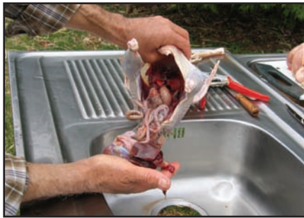
Pulling out the entrails as an unbroken “package.”

Reach again into the body cavity, fingers and hand encircling the gastrointestinal tract. The fingernails lead the way, tight to the rib cage, finding the seam between the chest wall and the rosy tubes of the tract and other organs, the large purple-red ball of the gizzard filling your grasp like a slippery apple. Grip all and pull. The tract and the organs pull free in one mass—connected only at the base of the abdomen—which you allow to hang over your drain.