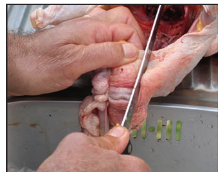
To cut away the vent intact, start with a cut on one side...

What a neat trick you’ve pulled off! You’ve drawn away all the interior struc-