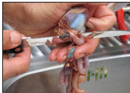
Cutting away the gizzard.

If you wish, you can cut through the muscle around the inner pouch, and peel the muscle mass away from the tough liner, leaving a butterfly-shaped cleaned gizzard. I usually prefer to cut away the muscle tissue in small bite-size pieces instead, keeping the blade’s edge away from the interior pouch and leaving it intact.