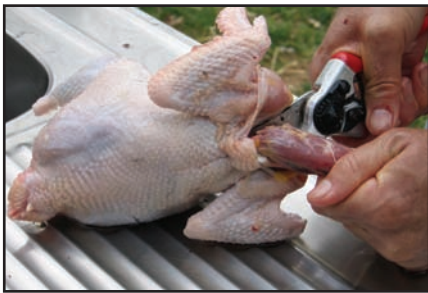
Cutting off the neck.

Do not leave a “stub” when you cut off the neck—that would leave jagged edges of sheared bone that may poke through your wrapping later. Instead, force the blades of your shears around the neck but well up between the shoulders of the wings. After your cut, the sheared edges will be protected from the wrapping by the shoulders.