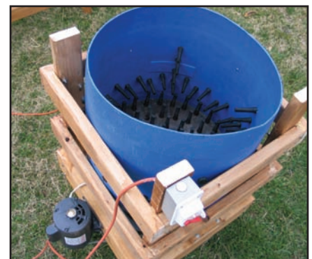
Mike Rininger's homemade Whizbang plucker.

if you frequently process large batches of birds: Just drop in four or more scalded birds, switch on the motor, and in a few seconds put the plucked carcasses on the worktable.