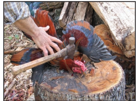
The chopping block.

A solid, stable round from a log makes a good chopping block. Drive a couple of large nails into the block, between which the bird's head can be positioned as you pull on the feet. Under such restraint, the bird is unlikely to continue struggling. Don't be rushed—pull on the feet, stretching out the neck, take a breath, and steady yourself for a decisive blow of the hatchet that takes off the bird's head with one whack. Hold it away from you and near the ground, so the blood will drain without spattering.