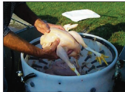
The Featherman Pro in use.