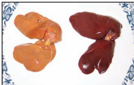
Livers of old bird and young bird compared.

a spillage of bile, rinse with more than usual thoroughness and proceed.