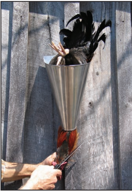
The killing cone.

is young enough for you to break the head off the neck. (I find birds at the fryer-broiler stage, and most old hens, easy to kill with this method. I cannot break the necks of mature cocks, ducks, or geese, so for those birds I use the cone or the chopping block instead.) Holding the head of the bird in the clutched fist of your strong hand, and the feet in the other, brace the bird over one thigh, and pretend you are going to pull it apart . At the right point of tension (which you can only learn by experience), give a sharp twist-snap downward-outward, and the head will separate completely from the neck. Hold the bird out away from your body until its spasms subside. (You will likely find this method difficult the first time you try it, and mistakenly conclude