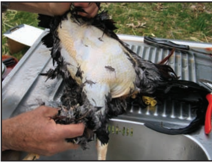
Above: Plucking by hand. Below: Using a mechanical plucker.