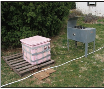
Harvey's butchering set-up includes a 15-gallon electric scalding tank and mechanical plucker and a work table with accessories.