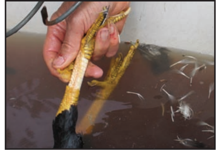
Below: Testing the scald.

You will learn only through experience when "enough is enough" in the scald.