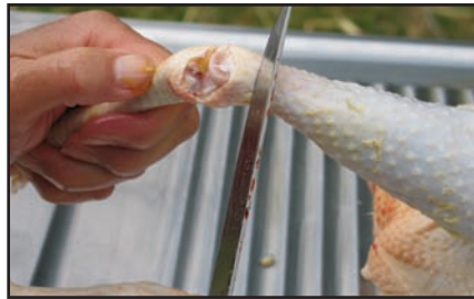
Cutting off the leg.

you can cut leg or neck any way you like.) Therefore, you should not use your shears to cut through the joint at the hock (corresponding to our knee) to remove the leg. Instead, hold the foot and pretend you are going to break the leg sideways at the hock. The resulting tension on the joint makes it easy to slice through the skin and find the cartilage-padded interstice between thigh and leg bones. Once the edge of your blade has found that space, it is easy to continue cutting through skin, connective tissue, tendon—anything but bone—until the leg is cut away.