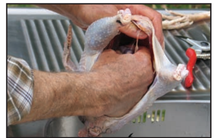
Reach in as far as you can... and pull out the heart.

Reach as far as you can into the body cavity to find an organ that feels like a large grape—the heart. Hook two fingers around it and pull it out. Squeezing out the remaining coagulated blood, rinse it and set aside (I use the steel mixing bowl with lid which I mentioned), along with the neck and feet and other good things you will be saving.