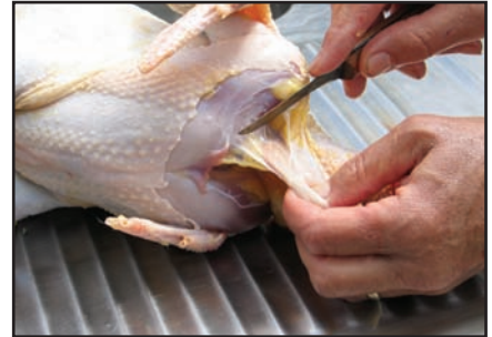
Above: The crop (empty if the bird has been properly starved). Below: If the bird was not starved, the full crop may spill its contents.

a semi-translucent membranous pouch (to the right of the bird's neck) in which the bird stores its food for pre-processing, before passing it on to the gizzard. Because you wisely starved your slaughter birds overnight, the crop is empty and this step is not messy. If the crop is full, it is no great problem—the contents will spill over the top of the carcass and the