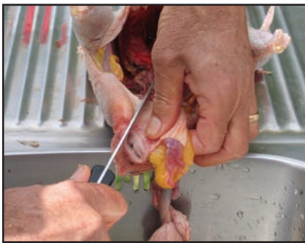
then on the other...