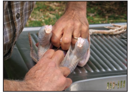
Insert two fingers from either direction.

Please note that the pressure exerted on the intestinal tract at this point can cause what I call a “poop attack,” the forcing out of some residual fecal material from the cloaca. A poop attack is likely to happen only if the bird was not properly starved in preparation for slaughter, but you can guard against it any time by hanging the vent end of the bird over a drain when you pull open the carcass. If there is an expulsion, rinse