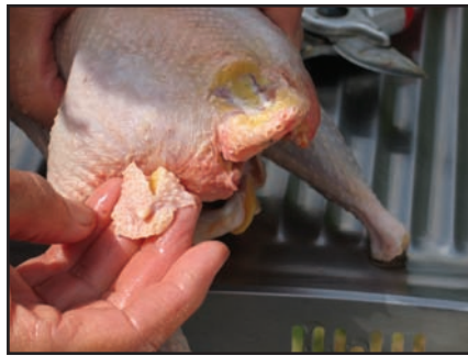
The oil gland removed.