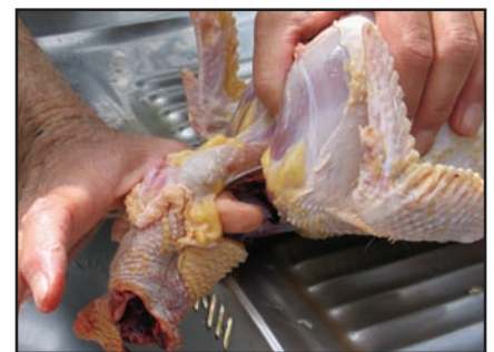
Above: Separate crop, esophagus, windpipe, and skin from the neck. Below: Cut all that tubular stuff off as close as you can to where it enters the body cavity.