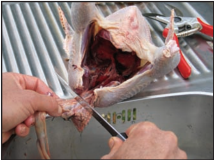
and end with a slicing cut beneath the vent.

tures without spilling stuff-we-don't-want-on-our-meat, and now they're hanging from the vent in one long, intact package. What now to complete the separation? Hang all that ropy stuff to one side of the vent, and position your blade