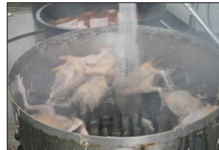
One of Eli Reiff’s Poultryman pluckers in action.

$3255) at http://chickenpickers.com/page10.html ; or call Eli at 570-966-0769. 🐔