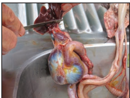
Cutting the liver from the bile sack.

The liver is the large reddish organ beside the gizzard. The clear tissue connecting it to the other organs is easily torn away with the fingers to leave it attached at one point only—to a small, dark-green sack the shape and size of a caterpillar—the bile sack. The bile it contains is essential for the bird’s digestion of fats, but is extremely bitter. Sacrifice a bit of the liver as you pare it away from its connection to the bile sack with your small knife. If on occasion you do have