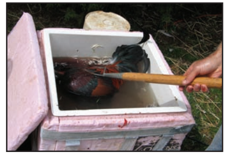
Above: Scalding the bird.

The key to an easy pluck is a good scald. Note that scalding temperature is nowhere near the boiling point . I set my thermostatically controlled scald to 145° F, and that is a good temperature to aim for if your scalding container is over a stove top or burner. However, it is not really necessary to use a thermometer to measure the temperature. Just stick in a finger. Can you immerse the finger without getting a burn, but you cannot hold the finger in for more than a second without burning? That's proper scalding temperature. Note that overscalding (either through too high temperature or scalding too long) starts to cook the skin, which then tears when you pluck. Underscalding, on the other hand, fails to loosen the feathers sufficiently, and they are difficult to pluck. No exact formula can be given for scald time—how long to scald depends on the age of the bird, the species, the point in the plumage cycle, probably the phase of the moon.