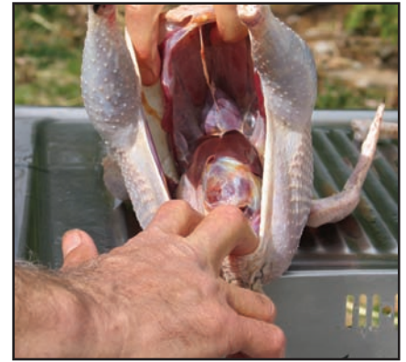
A stout pull opens the body cavity completely.

it away from the vent, being careful to avoid backwash into the body cavity.