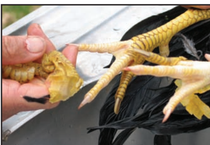
Cleaning the feet.

If you don't save the feet, don't ever tell anybody you learned butchering from me! Always save the feet. They are a valuable addition to the stockpot, yielding collagen, which is beneficial for the entire digestive tract. Remember how you used the scaly covering of the shank to test the scald? Simply continue with the same pinching-pulling action to pull the covering off leg and toes like a glove. Be sure to pinch tightly and pull the toenails as well, and the cuticles will pop off easily. The result is a pristine foot you will be proud to have in your stockpot.