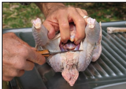
Slice through skin and fascia only to make a small opening into the abdomen.

Sooner or later, you will have a slip of the knife and a nick of the intestine, spilling some of its contents into the body cavity. Do not despair—even with such a mishap, your home butchering is vastly more sanitary than the filthy conditions under which commercial poultry is processed. After eviscerating, simply do a more thorough rinse of the interior cavity than usual.