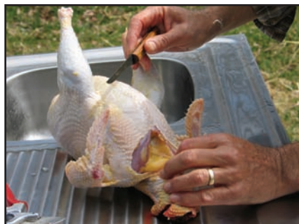
Starting the evisceration.

Start the evisceration at the skin where neck joins breast. Using your small knife, slice through the skin on the left side, and continue slicing through skin (only) to make a full circle around the neck. As you slice, you expose the crop ,