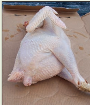
On butchering day the plucker was put to the test (left) and came through with flying colors.

was attached to the side of the 2 x 8, and we mounted the motor.