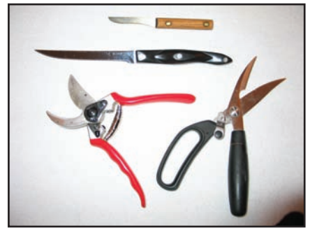
Quality cutting tools are essential.

The killing of the bird is typically the most difficult part of the process, emotionally and psychologically. Naturally you will want to do the job as quickly and humanely as possible. I use three methods. (Please note that, whatever method you choose, it is essential that the bird bleed out completely. The dressed bird will not