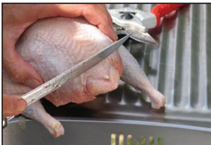
Cutting away the oil gland.

If it remains on the carcass, the oil gland (which secretes oil the bird uses in preening its feathers) may affect the flavor of your cooked bird. To remove it, start slightly forward of the little nipple of the gland and simply slice down vertically until hitting bone. Then turn the edge of the blade toward the end of the tail and make a scooping cut to slice off the nipple and the two fatty lobes of the gland beneath.