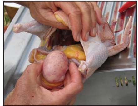
You will find numerous egg yolks, even fully formed eggs, in most hens.

developed egg. (The one in the picture is a finished egg ready to be laid, but is still inside the oviduct.) These “unborn eggs,” as my wife Ellen calls them, are a real treat: We add the small yolks to soup or broth just before serving (so they are just warmed through), and use the completed eggs as we do any other eggs.