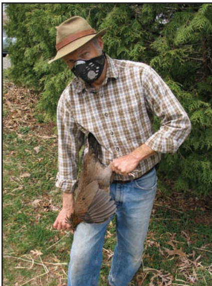
The English method. (Note use of mask to prevent inhalation of dander.)

is young enough for you to break the head off the neck. (I find birds at the fryer-broiler stage, and most old hens, easy to kill with this method. I cannot break the necks of mature cocks, ducks, or geese, so for those birds I use the cone or the chopping block instead.) Holding the head of the bird in the clutched fist of your strong hand, and the feet in the other, brace the bird over one thigh, and pretend you are going to pull it apart . At the right point of tension (which you can only learn by experience), give a sharp twist-snap downward-outward, and the head will separate completely from the neck. Hold the bird out away from your body until its spasms subside. (You will likely find this method difficult the first time you try it, and mistakenly conclude