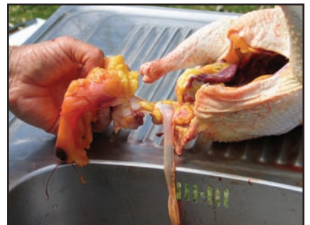
A deposit of body fat is easily rendered into high quality cooking fat.

Especially in a hen (and even more so in hens slaughtered in the fall), you will find a deposit of glistening, yellow fat at the lower end of the body cavity. This fat is easily rendered into high quality cooking fat. (Simply cut the fat into small pieces and heat in a heavy pan over low flame until the fat liquefies, strain, and store in small jars in refrigerator or freezer.)