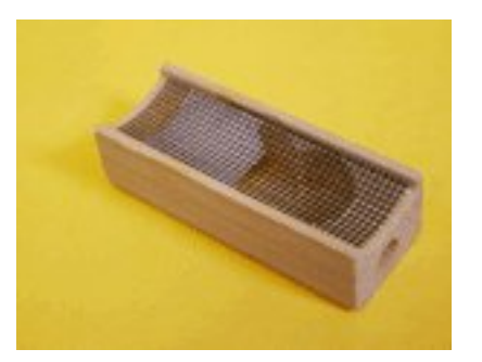
Two common queen cage patterns shown above

Pry off whatever is holding the queen cage in place. Before you do this have something to cover the hole when you pull the cage so you can work with the queen cage without disturbing the other bees.