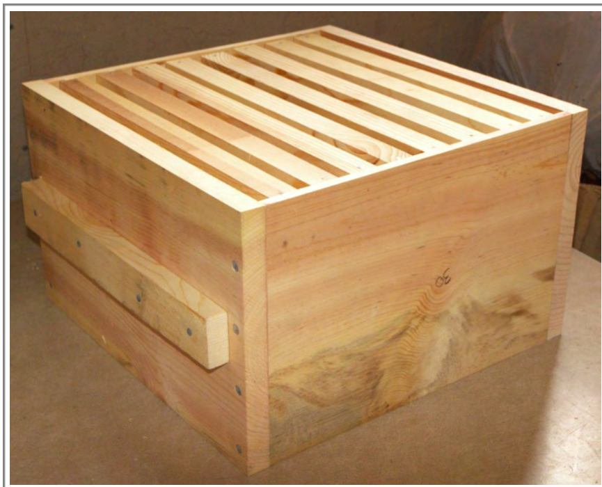
Warre Hive Box with Top Bars in place

Forms the basis of the hive. This is where the bees build their honeycomb.