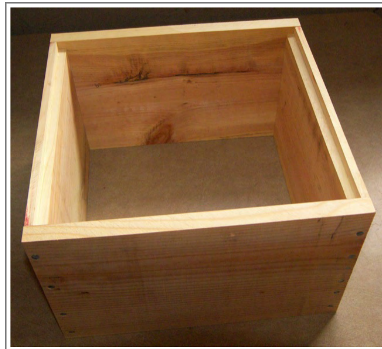
Warre Hive Box with No Top Bars