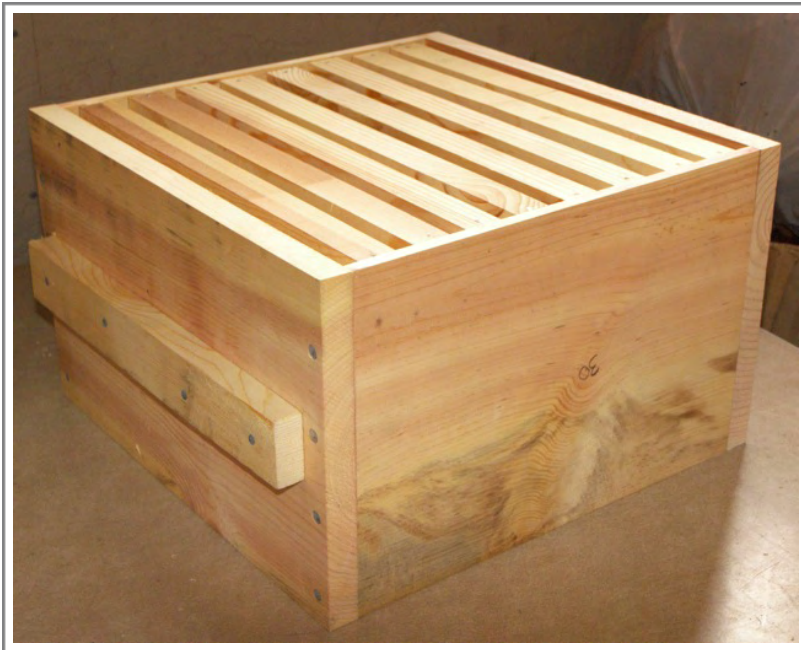
Hive Box with all 8 top bars

Each Hive Box has its own set of Top Bars. When the hive boxes are stacked on top of each other, the top bars in each box provide a foundation for the bees to build comb on.