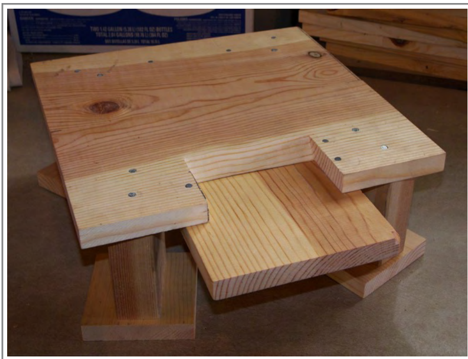
Warre Hive Floor with 4 legs

This provides the foundation for the whole beehive.