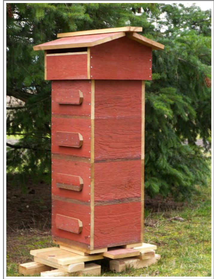
Warre Hive Built from Recycled Barn Cedar