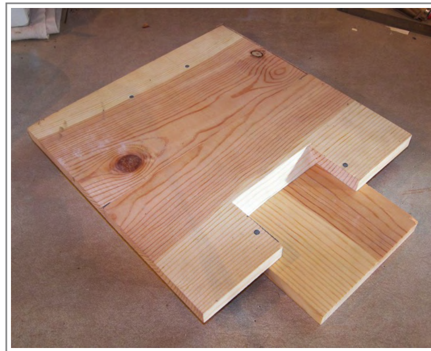
Warre Hive Floor without legs