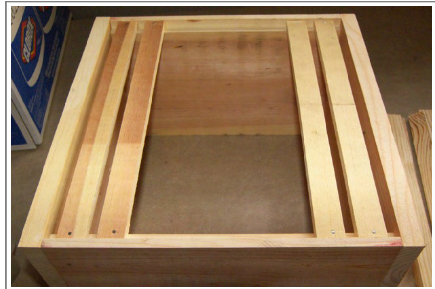
Hive Box with 4 top bars