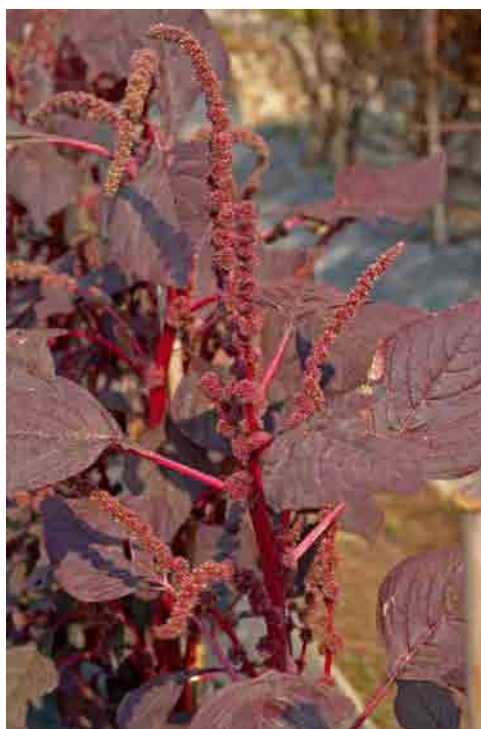
Fig. 6. Maturing seed stalks of amaranth

A lightening or yellowing of foliage color is an indication that seeds are beginning to mature (Fig. 6). Types with an apical inflorescence are usually harvested once. Types with several side shoots are harvested several times as the seeds mature. The harvested seed stalks are placed on a clean tarpaulin or into very fine mesh nylon bags and allowed to dry in the shade.