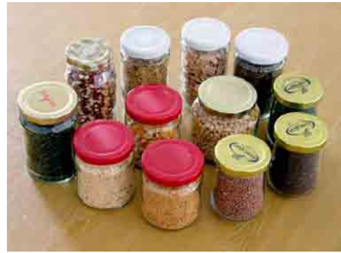
Fig. 5. Seeds stored in air-tight containers to prevent them from absorbing moisture

Temperature. For most vegetable seeds, a temperature below 15 °C is ideal. You can keep the seeds in an air-tight container and place the container in the refrigerator. For short-term storage, keep the seeds in a cool and shady dry place.