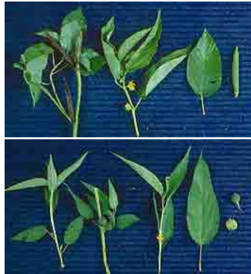
Figs. 23, 24. Popular species Corchorus olitorius (top photo) and C. capsularis (bottom photo) are closely related, differing mainly in pod shape

Among the more than 15 species of Corchorus , two are most common: C. olitorius and C. capsularis . The former produces long capsules while the latter produces round capsules (Figs. 23, 24). Both types of capsules are harvested when fully mature but before seeds begin to shatter.