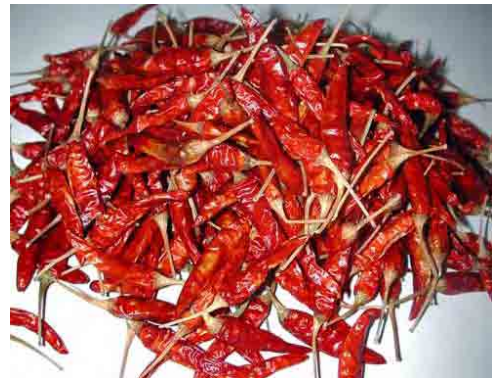
Fig. 38. Chili pepper prepared for dry seed extraction

Pepper seeds may be extracted from fresh fruits (Fig. 37) or from fruits that have been dried in the sun for a few days (Fig. 38). Seeds may be removed by hand or extracted by grinding the fruits and separating the seeds from fruits with a series of water rinses. Spread the seeds on a screen for drying under shade for 2–3 days but bring them inside every evening.