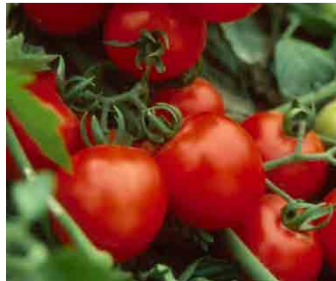
Fig. 46. Tomatoes ready for harvesting

Allow tomatoes to completely ripen on the plant before harvesting for seed (Fig. 46). Seeds from green, unripe fruits will be most viable if extracted after allowing the fruits to turn color, but this is not advisable.