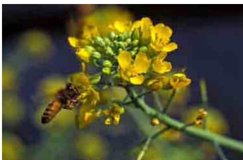
Fig. 9. Honeybee pollinating brassica flower

Special techniques may be used to facilitate the emergence of seed stalks. For cabbage, an “X” crosscut is made at the top