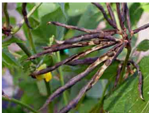
Fig. 33. Shattered pods