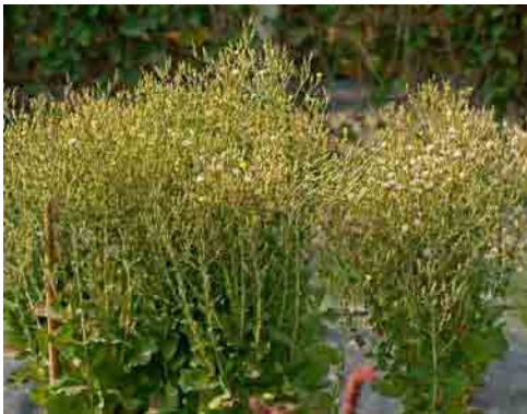
Fig. 28. Staked plants

Lettuce seed loses its viability quicker than most vegetable crops. Under ideal cool and dry conditions, seeds may maintain their viability for up to 3 years.