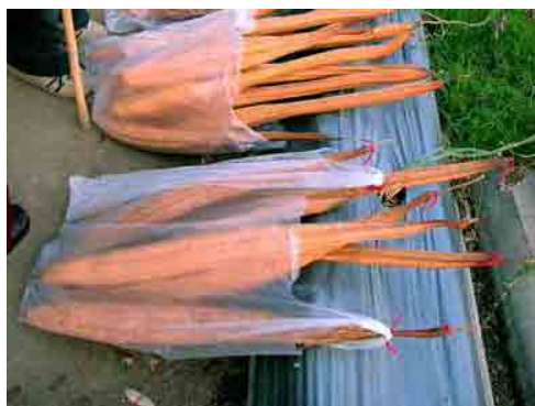
Fig. 16. Mature luffa gourd fruits

brownish color (Fig. 17). Bitter gourd fruits will turn orange. Some wax gourds will be covered with a pale-white powdery wax on the surface of the fruit. After harvest, the fruits can be kept in a shed for a couple of weeks to allow the seed to further ripen.