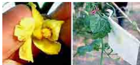
Figs. 14, 15. Pollen on anther of male flower is rolled onto stigma of female flower (left) and the female flower is bagged (right)

Hand pollination. Cap or bag female and male flower buds on the same plant or nearby plant of the same variety. Then select male flowers when they bloom, turn over their petals to expose their anthers, and gently roll the anthers over the stigma of the just bloomed female flowers (Fig. 14); you can see a layer of pollen has been transferred on the stigma. After pollination, cap or bag the female flower again to exclude insects (Fig. 15). Mark the pollinated female flower by wrapping a string to the pedicel.