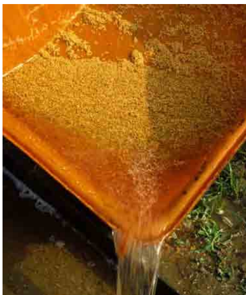
Fig. 48. Rinsing seeds

This fungus not only eats the gelatinous coat that surrounds each seed and prevents germination, it also produces antibiotics that help to control seed-borne diseases such as bacterial spot, canker, and speck.