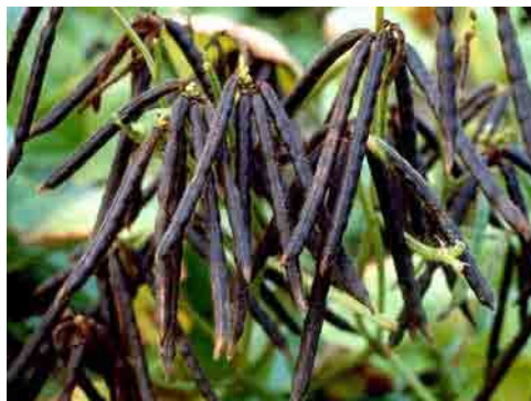
Fig. 32. Mature pods ready for harvesting

machine, adjust the speed of the machine in order to avoid seed damage.