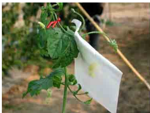
Fig. 3. Bagging bitter melon flower for hand pollination

Isolation in distance. Pure seeds can be produced by leaving enough distance between two or more varieties to prevent cross-pollination by insect or wind-blown pollen. How far apart differs among vegetables; this will be described for each vegetable in the following chapters.