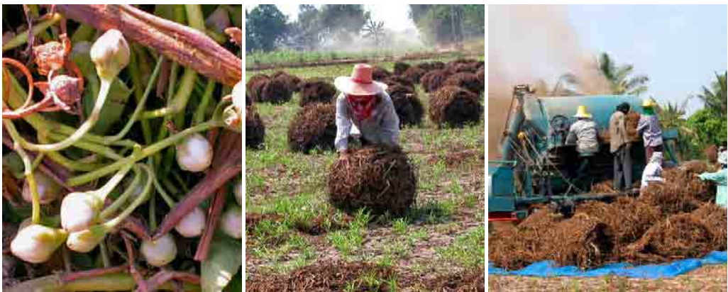
Figs. 25–27. Mature seed pods (left); rolling plants into loose bundles for drying (center); mechanical threshing of dried plants (right)

Kangkong seed will store for up to two years, a shorter time compared to most vegetable crops. Storage pests are a problem if seed moisture content is high.