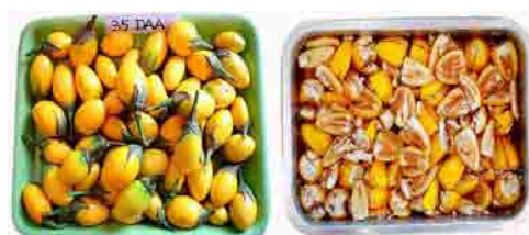
Fig. 21. Mature eggplant cut into small pieces for fermentation and seed extraction

The outer covering is peeled off and the flesh with the seeds is cut into thin slices (Fig. 21). These are then softened by soaking until the seeds are separated from the pulp. If the material is allowed to stand overnight in this condition, the separation of seeds from the pulp becomes easier. After separation, the seeds are dipped into water. The plump seeds will sink to the bottom. The seeds should then be dried on a mesh for a couple of weeks in a cool, dry place before storage.