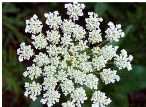
Fig. 10. Cluster of carrot flowers (umbel)

Carrot plants produce perfect flowers (Fig. 10) that are pollinated by insects. Separate