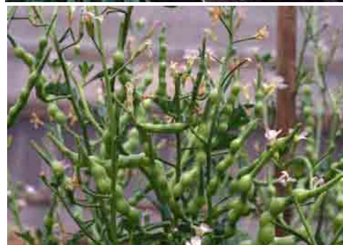
Figs. 39, 40. Radish roots (top) and ripening seed pods (bottom)