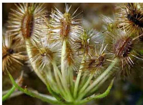
Fig. 11. Cluster of mature seeds

Allow seed to mature in a cool, dry location for an additional 2–3 weeks. Seeds can be removed by hand-beating or rubbing umbels between hands. Winnow to clean. Remove spines from dry seed by rubbing.