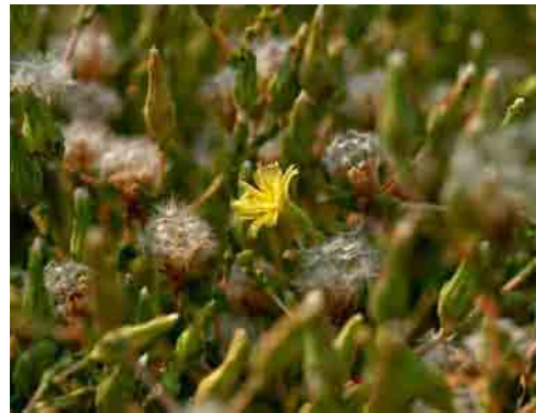
Fig. 29. Shattering seeds