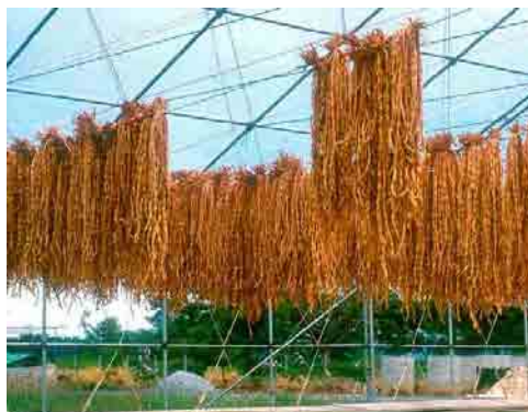
Fig. 52. Yardlong bean pods hung in bundles for drying

Pods are dried in the sun for approximately 3 days (Fig. 52). For small amounts, pods may be opened by hand. For large amounts, hang the pods in a burlap bag and beat them with a stick, or put on the floor and walk on them. Remove large chaff by hand or winnowing. Discard blemished and shriveled seeds. Place remaining seeds under shade for 1–2 weeks for further drying.