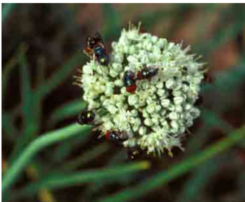
Fig. 36. Insects pollinating onion flowers

Bulb-to-seed. Harvest in the fall and select the largest bulbs (which naturally produce more seed). Clip tops to 15 cm and cure for three to four weeks. After the bulbs