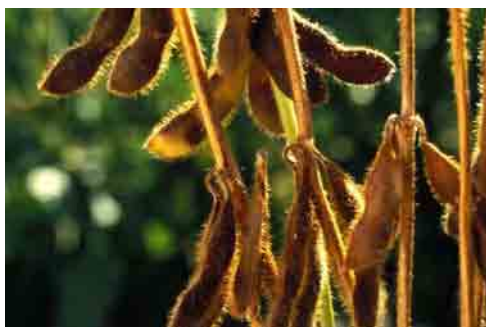
Fig. 41. Pods ready for harvesting

When soybean matures, the leaves turn yellow and drop, pods become dry, and seeds lose moisture (Fig. 41). Harvesting should be done just before pods begin to shatter; the plants may be cut at the ground level, tied up to a bunch or put in a mesh bag, then dried in the sun for 3 days.