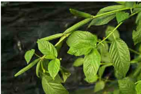
Fig. 22. Healthy and vigorous jute plant with seed capsules

Select plants that are uniform in appearance, healthy and vigorous (Fig. 22). Cover flow-