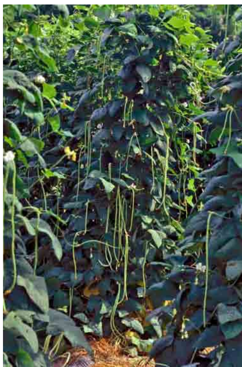
Fig. 51. Yardlong bean pods

Yardlong bean produces perfect, self-pollinating flowers. Cross-pollination by insects is possible but rare as self-pollination occurs before the flower opens (the opening anthers push up against the stigma). Isolation is not necessary.