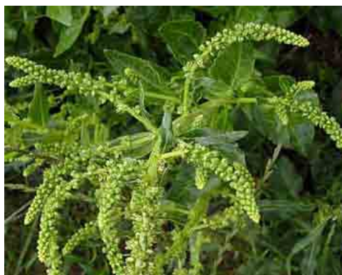
Fig. 8. Seed stalk of beet

Store stalks in a cool dry location for 2–3 weeks to encourage further seed ripening. Do not heap stalks on top of one another since this causes seeds to ferment. Handle stalks as little as possible since seeds shed easily. Small quantities of seed can be stripped by hand as seed matures. Large numbers of stalks can be put into a bag and beat with a stick. Chaff is winnowed away.