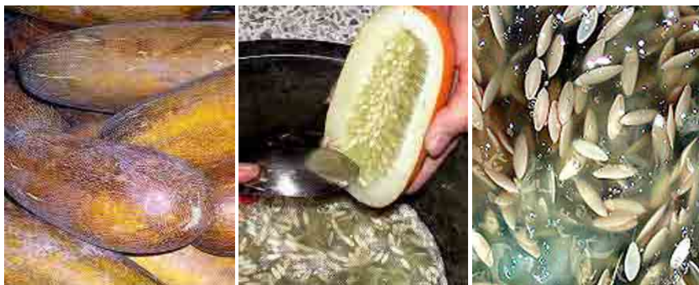
Figs. 17–19. Wet seed extraction: mature cucumber (left), seed extraction (center), and fermenting seed (right)

For ‘dry seeds’ such as luffa and bottle gourd, keep the seeds in the fruit until they naturally separate from the flesh. This can be identified when you shake the fruit, the sound of seeds moving inside is heard. Cut off the bottom of the fruit and shake the seeds out, winnow to clean the remaining chaff, then place the seed on a screen for further drying before storage.