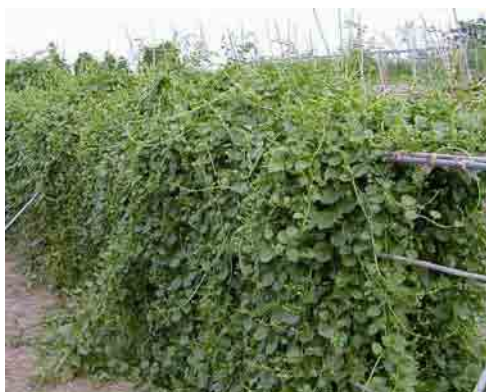
Fig. 30. Malabar spinach growing on a trellis

Malabar spinach grows well in hot, humid climates and is adaptable to most soils. Trellised plants work best from the point of view of flower induction, fruit harvesting and crop management (Fig. 30). Short days (13 hours or less) are required for flowering.