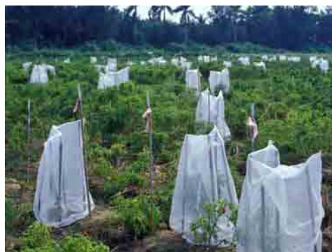
Fig. 4. Isolation of pepper selections in nylon net tunnels

After saving your seeds, it is important to keep them alive for future use. Newly harvested seeds should not be immediately stored in a plastic bag because the moisture content of the seed is still high and will lead to deterioration.