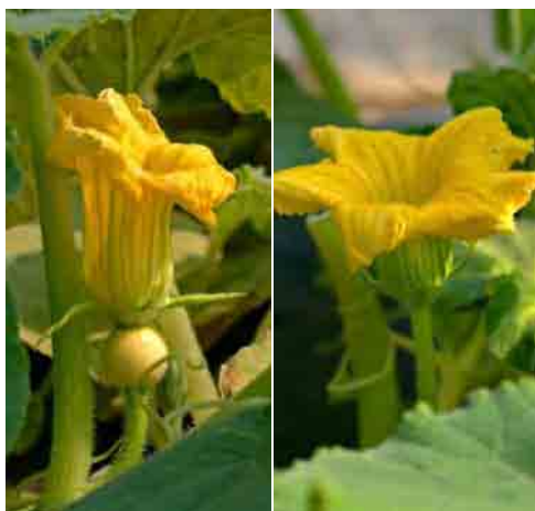
Figs. 12, 13. Female (left) and male (right) flowers of squash

Most cucurbit plants produce separate male and female flowers on the same plant. Female flowers can be identified by locating the ovary (a small looking cucumber, melon, gourd, etc.) at the base of the flower (Fig. 12). The flowers are insect-pollinated, and easily cross within species. However, seed savers can grow more than one variety at a