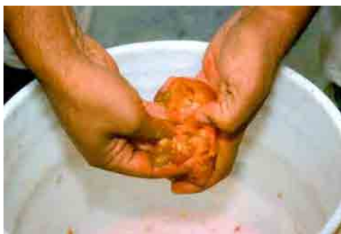
Fig. 47. Extracting seeds by hand

A layer of fungus will begin to appear on the top of the mixture after a couple of days.