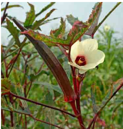
Fig. 34. Okra pod and flower

Plants for seed multiplication can be selected