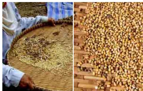
Figs. 43, 44. Winnowing to remove chaff