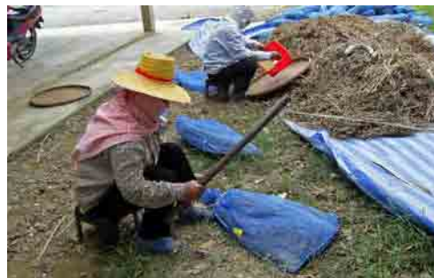
Fig. 42. Threshing pods with a stick

Soybean seed does not keep well in storage compared to the other legumes. The germination rate drops rapidly under room temperature conditions, especially in the tropics. If cool storage is unavailable, place seed in an air-tight container and add burned lime (calcium oxide) at the rate of 20–30% (w/w). Keep seed at room temperature.