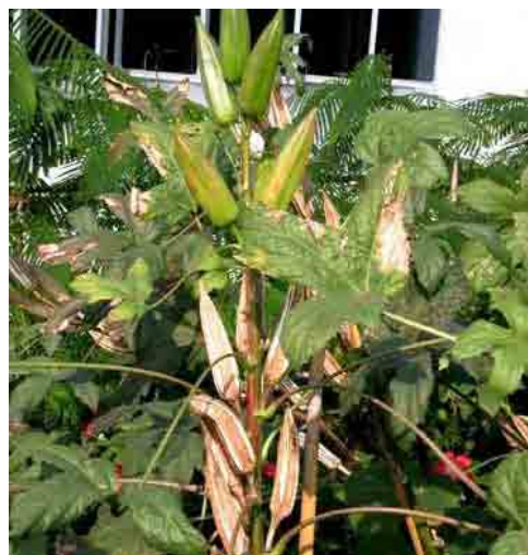
Fig. 35. Pods maturing from the base of the plant