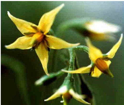
Fig. 45. Tomato flower cluster

Isolation of plants is usually not needed and a single plant can produce thousands of seeds. Tomatoes produce perfect, self-pollinating flowers (Fig. 45). Anthers are fused together into a little cone that rarely opens