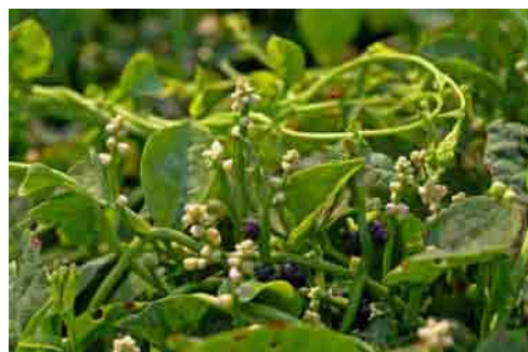
Fig. 31. Flowers and mature fruits

Harvest mature fruits with dark purple color (Fig. 31). The vines sometimes turn brown or yellow at this stage. Fruits may be harvested singly or in clusters.