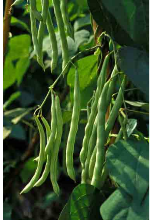
Fig. 7. Maturing bean pods

Pods are harvested when they have turned yellow but are not yet completely dry. The inner seeds will be firm, well developed, and beginning to loosen inside the pods. Harvesting is often done in the morning to avoid losses due to shattering.