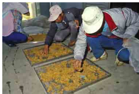
Fig. 49. Preparing seeds for drying in an oven

After fermentation, fill the seed container with water. Let the contents settle and begin pouring out the water along with pieces of tomato pulp and immature seeds floating on top. Viable seeds are heavier and will settle to the bottom of the container. Repeat this process until water being poured out is almost clear and clean seeds line the bottom of the container (Fig. 48). Pour these clean seeds into a fine-mesh strainer. Let the excess water drip out and invert the strainer onto paper towel, fine mesh, or newspaper. Allow the seeds to dry completely in an oven (Fig. 49) or in partial shade (Fig. 50). Break up the clumps into individual seeds, label and store for later use.