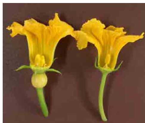
Fig. 2. Imperfect flowers of squash: female flower with exposed stigma (left) and male flower with exposed anthers (right)