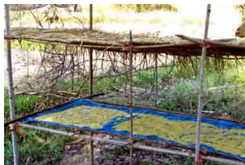
Fig. 50. Drying seeds in partial shade