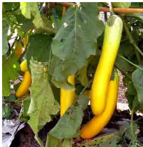
Fig. 20. Fruits at harvest

Harvesting is done when fruits are fully ripe (the skin of fruit turns brownish-yellow in green varieties or brownish in purple varieties) (Fig. 20). Harvest and store the fruits in a shed for a week until the fruits get soft.