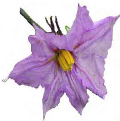
Fig. 1. Perfect flower of eggplant: the stigma (green) is surrounded by anthers (yellow)

Pollination occurs in plants when pollen from the anthers of the flower is deposited on the stigma. In some perfect flowers, self-pollination occurs. Lettuce, tomato, and okra have the stigma so close to the anthers such that the slightest wind movement can cause the pollen to drop onto the stigma within the same flower. In peas and beans, self-pol-