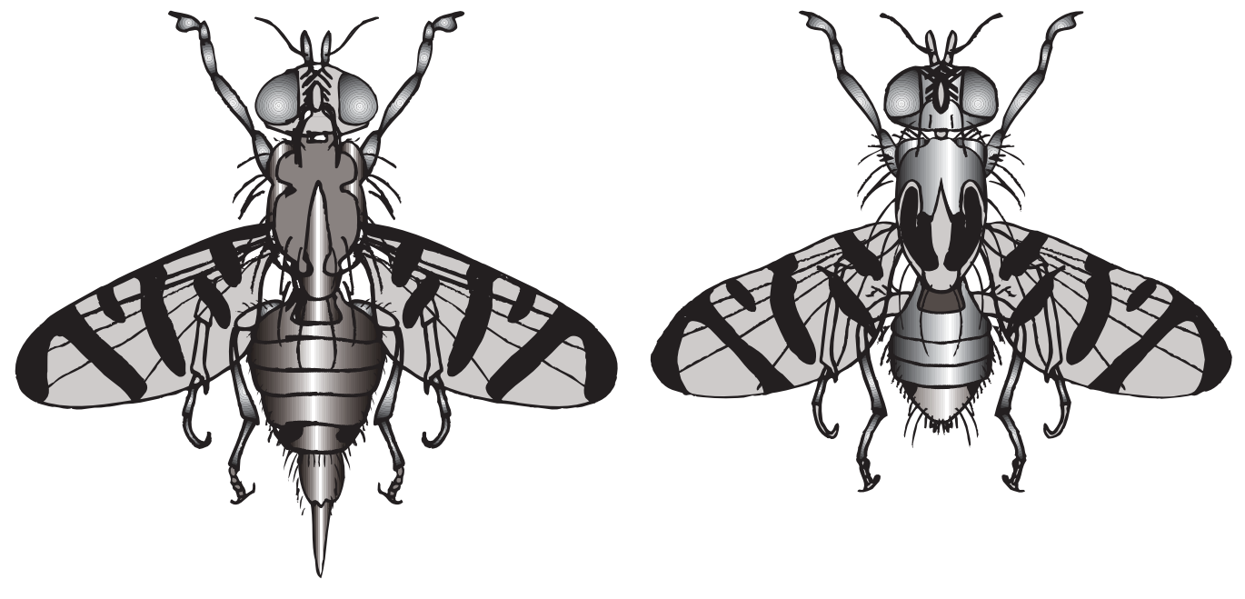
Fig. 1. Female (left) and male (right) adult pepper maggots.

soil over a 10- to 14-day period and are active from June 1 through mid-August. Adult flies are brightly colored with a pale yellow head, green eyes, honey colored thorax, pale yellow abdomen, and clear wings with brown bands (Fig. 1). Female pepper maggot flies are about the same size as a housefly while males are slightly smaller. Females live an average of 23 days but can live up to 45 days. After mating, a female can lay 50 to 60 eggs, depositing them in punctures she creates with her ovipositor in the skin of the pepper fruit. Eggs are about 0.08 inches long, white, and "crookneck" shaped. Maggots emerge from eggs in 8 to 10 days then burrow into the pepper fruit and feed there for about 2 to 3 weeks. Fully-grown maggots are 0.39 to 0.47 inches long and creamy white to yellow in color (Fig. 2). Mature maggots exit the pepper, drop to the